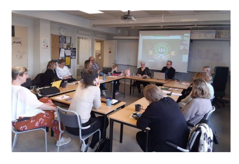
Presentation of DHB history, the Swedish organisation