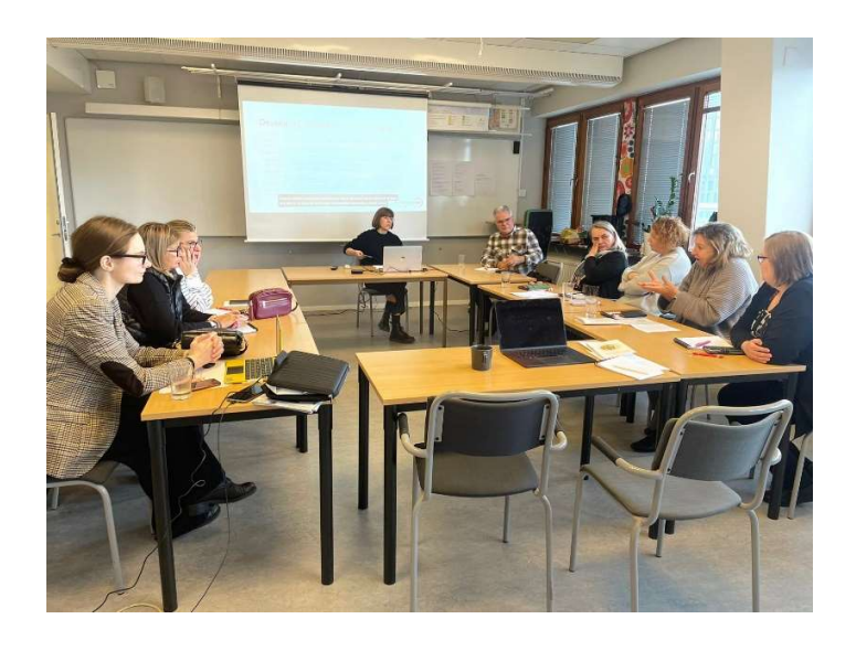
Workshop on FEPEDA Strategy

Many thanks to the members for their active participation in this MC meeting It was agreed that the AGA meeting 2024 will be held on 18 and 19 October 2024 in Madrid, Spain. As usual, it will be preceded by a MC meeting and followed by another MC meeting.