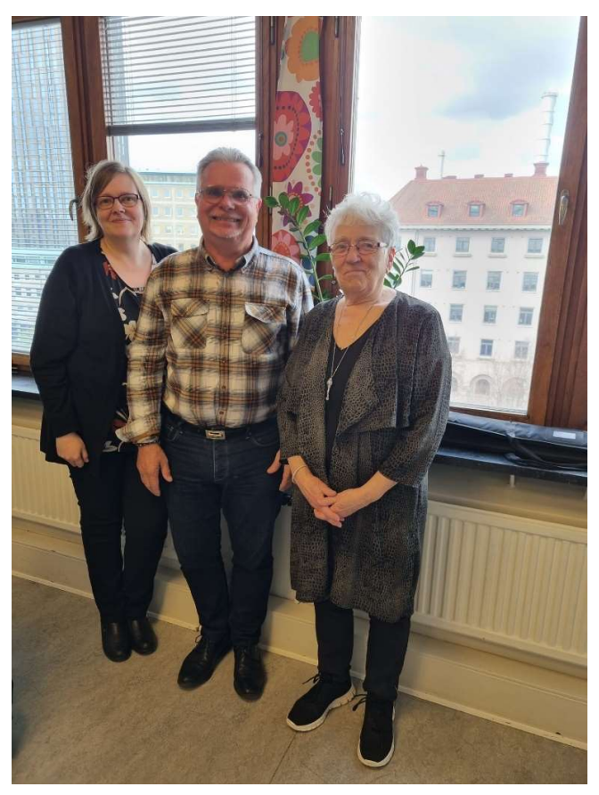
Previous Presidents and current President of FEPEDA