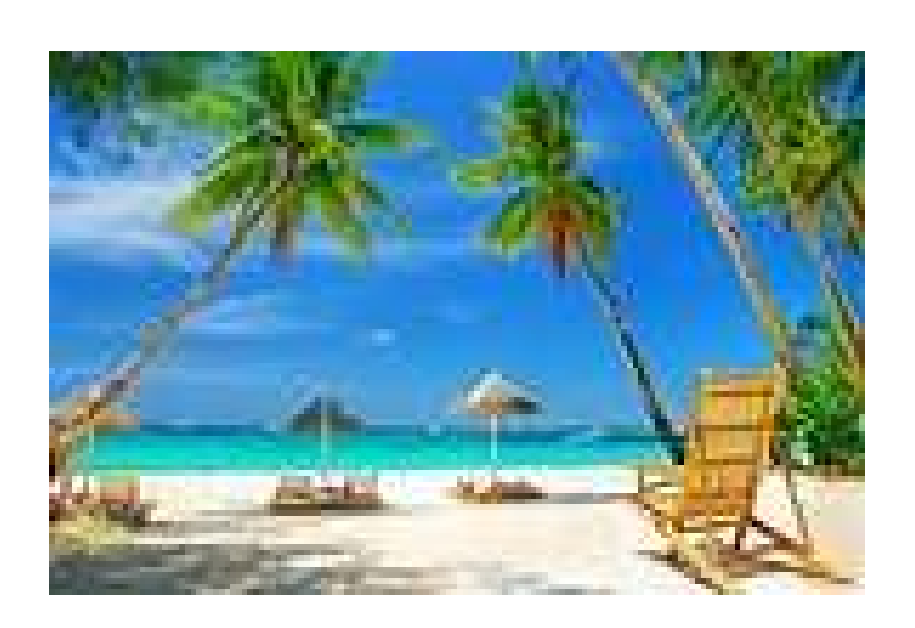
Have a nice Summer